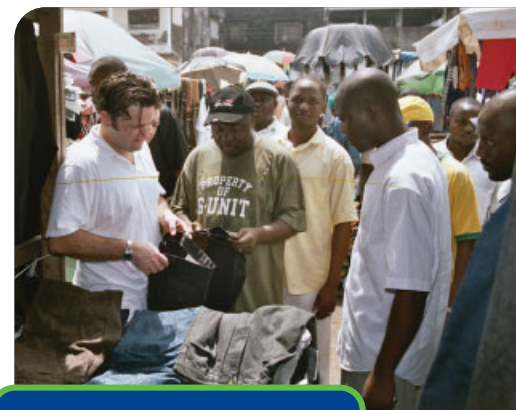
Final checking going on in a market in Kampala, Uganda and supervising the shipping operation