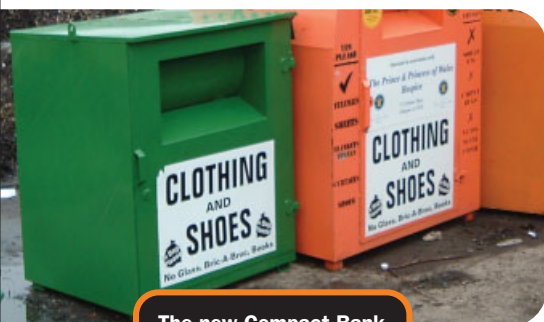
The new Compact Bank

Well, over 120 of the new Maxi banks are now in place and more are in the pipeline. The first of the TUBS is about to be sited and another five will be sited in the coming weeks. The further happy news is that there is a new sister for the family; The Compact Bank. The Compact Bank is a direct response to requests for a low visibility receptacle for use in sensitive sites. This bank is intended for use in conservation areas and street recycling sites where visual impact needs to be minimised without compromising practicality and safety concerns. Fife Council has already ordered 20 Compact Banks and discussions are under way with Edinburgh about supplying a variety of sites. We are looking to site about 50 in the next few months.